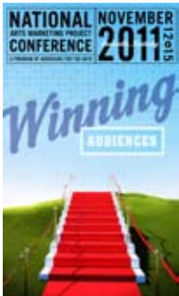
The 2011 NAMP Conference On Site Program

The onsite program goes to all participants and is used as a resource throughout the year. We have maintained ad rates this year to help you combat the effects of slashed travel budgets. Your print ad can generate awareness and revenue among creative leaders from the arts and creative business communities.