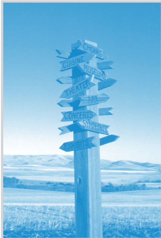
This signpost in Pendleton, Oregon, promotes many diverse art forms and cultural activities that contribute to the local economy.

This report outlines steps governors can take to incorporate arts and culture into state economic development plans and policies. Specifically, Chapter 2 addresses approaches for better identifying and analyzing a state’s arts and cultural resources so that state policymakers may better understand the existing creative enterprises in their state and the dynamic roles that these enterprises play in the state’s economy. Chapter 3 focuses on ways to incorporate the arts and culture into state planning policies. This often involves convening a strong leadership body comprising experts from public, private, and nonprofit sectors to develop a distinct vision for tying arts to economic growth strategies. Chapter 4 examines specific strategies states can take to implement their plans. Governors can develop the arts and culture sector through for-profit and nonprofit businesses, non-arts industries, individual entrepreneurs, and arts networks as well as through ensuring a skilled workforce for the sector to draw upon and education in the schools to cultivate understanding, appreciation, and demand for arts and cultural goods and services.