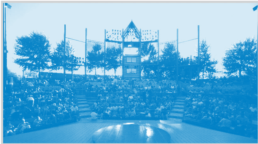
The Idaho Shakespeare Festival's performances, architecture and educational programs attract both residents and travelers.

These publications are available on the NGA Center Web site, www.nga.org/center .