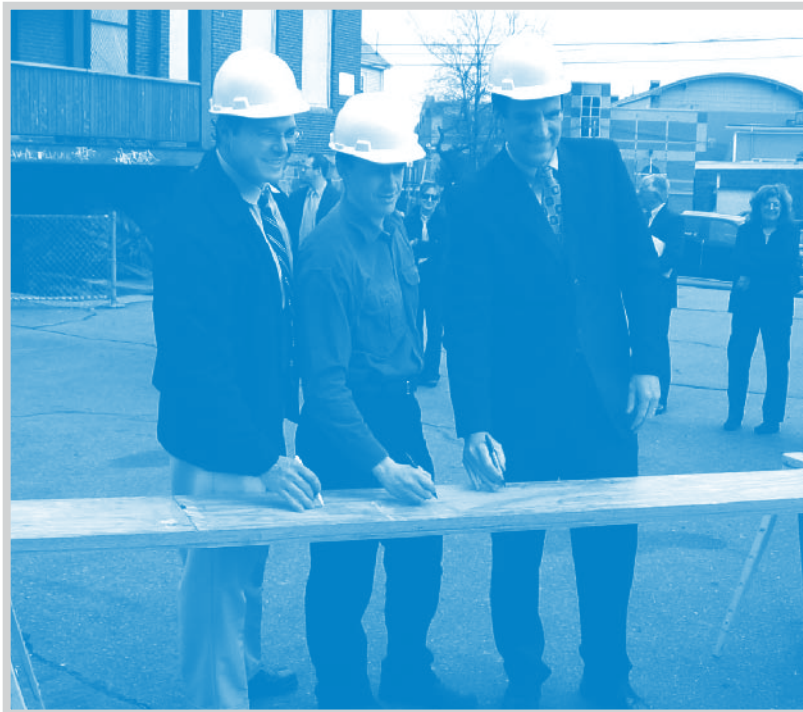
The groundbreaking ceremony for Keen Studios in Chelsea, Massachusetts, launched the conversion of a historic elementary school into artist live/work condominiums.

issues; catalogue best practices; provide technical assistance to artists and arts businesses; and work with state, local, and nonprofit developers to create affordable, sustainable housing models, the initiative hosts an electronic bulletin board where artists and property owners can post their needs and available spaces.