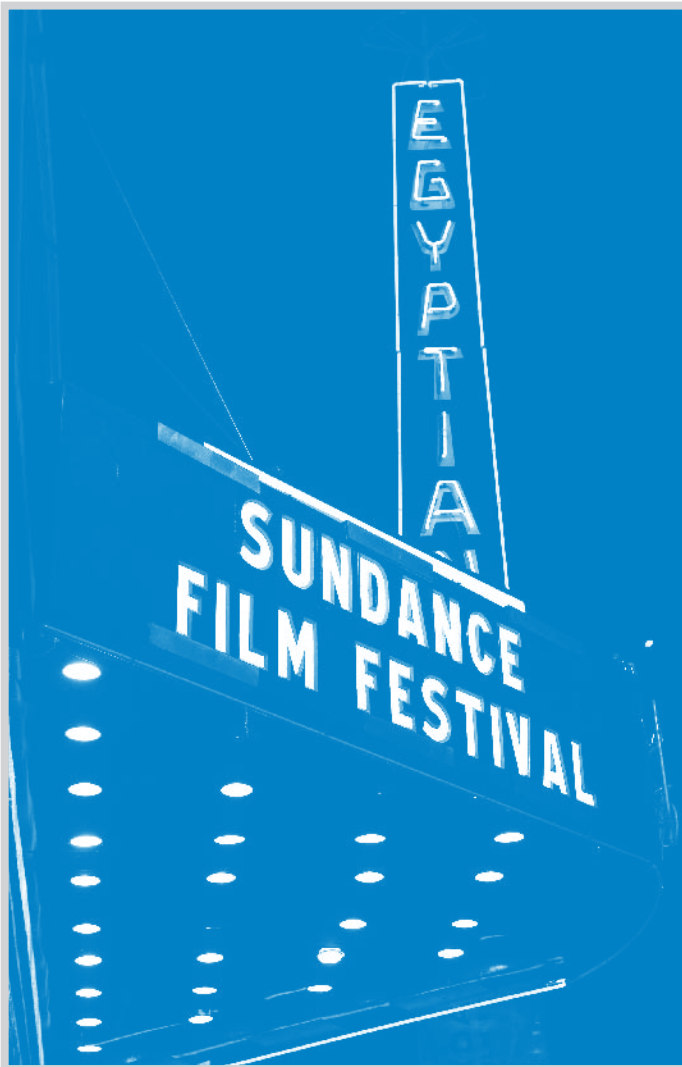
The Sundance Film Festival, a keystone event in the nation’s film industry, attracts a global audience to Utah each year.

Another industry states have specifically targeted is the crafts industry. For example, HandMade in America in North Carolina —established in Asheville in 1993 with assistance from the North Carolina Arts Council—strives to make western North Carolina “the center for handmade objects in the United States” by encouraging and enabling product development among local craft artisans. 27 HandMade hosts a business boot camp to teach business planning, marketing, and entrepreneurship skills to artists. HandMade links more than 320 regional artists, crafts producers, bed and breakfasts, farm tours, restaurants, and other businesses through a 200-mile-trail system that is part of a larger tourism marketing campaign.