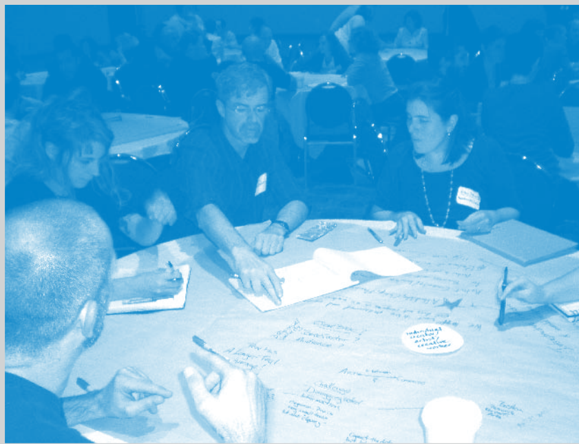
Rhode Island citizens map their cultural resources.

Identifying the right people to lead is critical to the success of planning efforts. A common strategy is to establish a special council, task force, or office charged with advancing the state's economy through the arts.