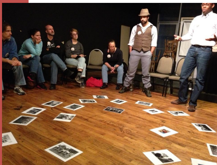
Highlander Research and Education Center's Art and Cultural Organizing session at MicroFest: Appalachia.

I learned in Appalachia what it looks like when culture, place, identity, and community come together in the struggle for social justice. I witnessed how mountaintop removal causes great pain, and experienced music as an integral part of organizing. I became aware