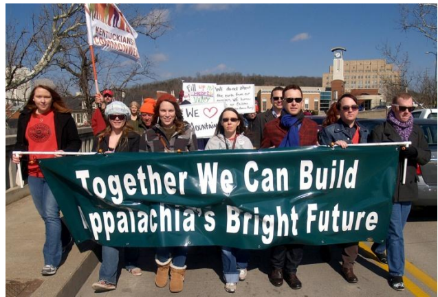
More than 1,500 Kentuckians rally at the Kentucky State Capitol for the 8th annual "I Love Mountains Day," February 14, 2013.

The Building Home collaboration between Virginia Tech’s theater department and the New River Valley Planning District Commission's Livability Initiative is using theater and the “BUILT” participatory board game developed by Sojourn Theatre to analyze what is needed and to envision alternatives for a regional plan. Theater has encouraged participation by a larger and more diverse group of people than usually engage in planning. The game has offered an experience of decision-making that moves players along a continuum of grappling with and understanding individual, neighborhood, and regional interests.