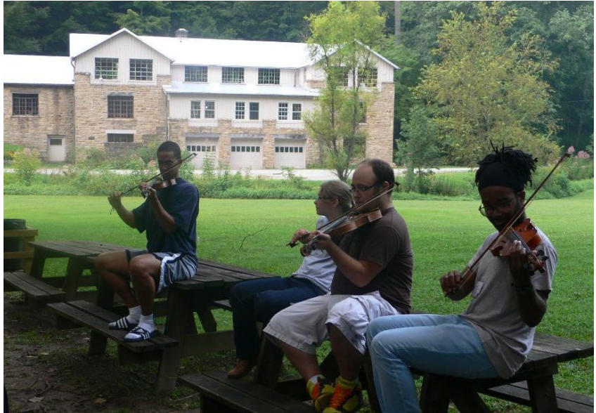
STAY Project Summer Institute.