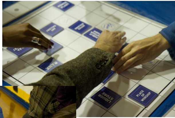
MicroFest participants playing the BUILT game.

Playing two rounds of the BUILT game at MicroFest left me with an experience of the creative tension between working within the system and using our imagination to stretch or transcend it. We were asked to make land use decisions regarding where