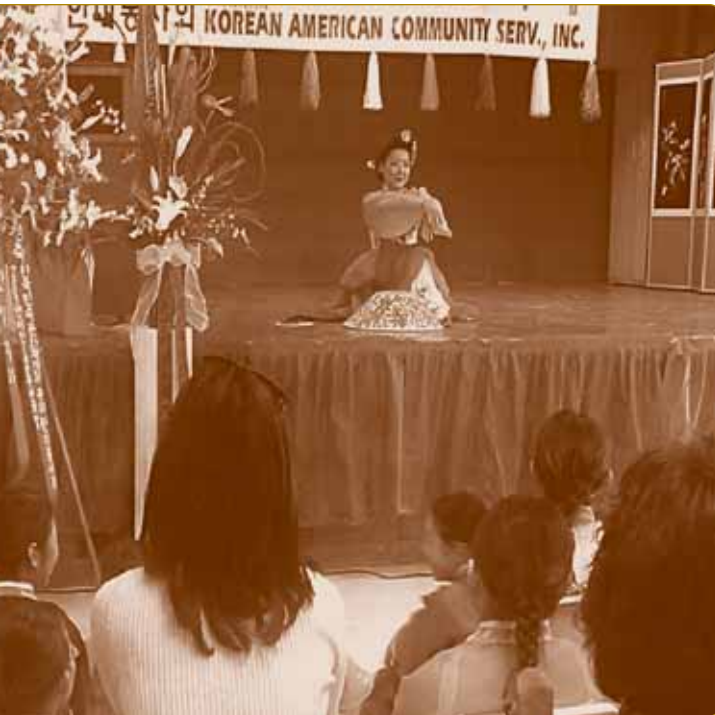
Fan dancer entertains and provides a model for future dancers at the Centennial Celebration of Korean Immigration to the United States, Korean American Community Services, San José.

Participatory arts cannot happen alone; they are necessarily community-based and often intergenerational. These voluntary group efforts grow out of specific shared traditions and are usually rooted in a heritage of ethnicity or religion. Their impetus is the expression, expansion, and overlapping of received traditions into present time and circumstance. While participatory arts encompass many instances of individual creativity, their cultural force comes from explicit group dynamics that foster and reinvent traditional art forms as new shared expressions of culture.