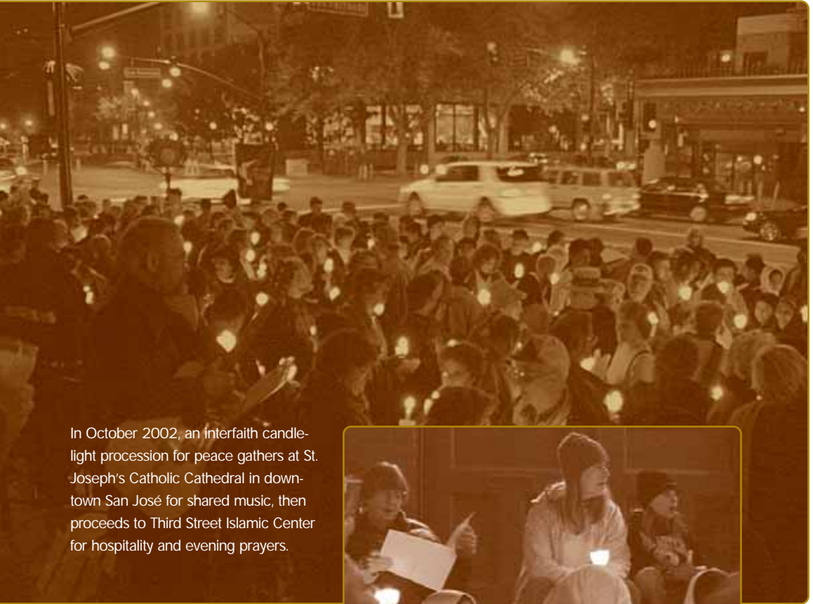
In October 2002, an interfaith candlelight procession for peace gathers at St. Joseph's Catholic Cathedral in downtown San José for shared music, then proceeds to Third Street Islamic Center for hospitality and evening prayers.