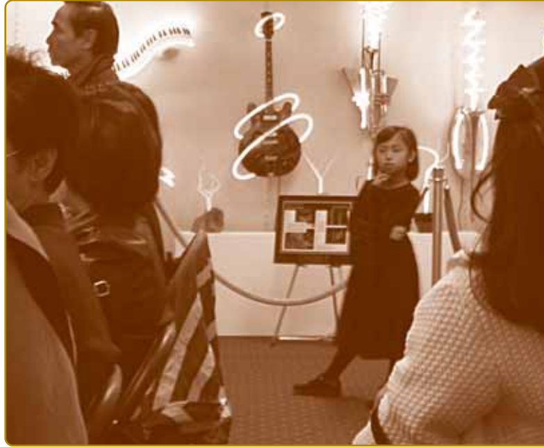
A young audience member considers the performances at the Vietnamese Folk Arts Institute recital at the Milpitas Community Museum, in front of its exhibit of musical instruments.