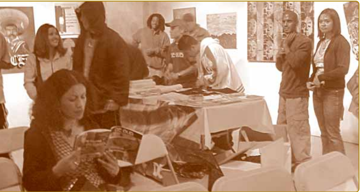
Members of Silicon Valley De-Bug, “The Voice of the Young and Temporary,” sell posters as the crowd gathers at MACLA for the Grand Slam Prelims of the South Bay Teen Poetry Slam League.

Bonded-bridging is a conceptual tool that expands the national dialogue about social capital formation so that it becomes possible to include many activities of immigrant groups in the favored “bridging” category. As such, it equips policy makers with a consequential, specifically ethnic piece that is missing or underplayed in the studies like Bowling Alone and “Better Together” that currently direct national research priorities.