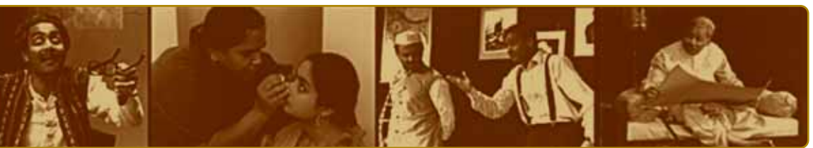
From Naatak: Bay Area Indian Theater and Independent Film website, www.naatak.com .

Theatre productions are particularly suited to utilize immigrants' home languages and cultures, and bring their strengths to bear upon contemporary United States' issues. Overlapping of heritage forms with exploration of local themes has both bonding and bridging effects. Within the complexity of the theatre, immigrant groups are able to simultaneously reinforce and expand their ethnic traditions, as they relate them to the new situations that they are negotiating in Silicon Valley.