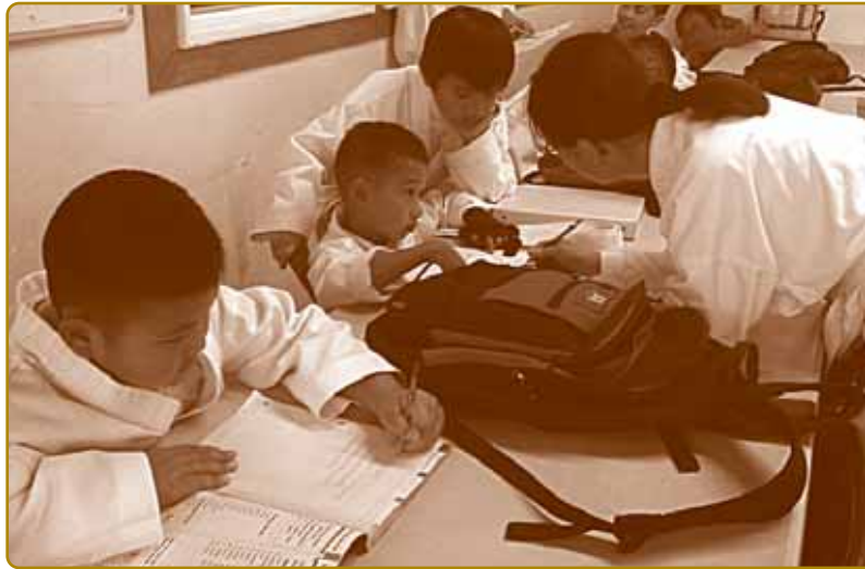
Students at the Vietnamese American Center complete their homework before moving to martial arts exercises in the next classroom.

When separate bonding and bridging functions are programmed to occur together in the same physical space or time frame, this juxtaposition creates a zone of familiarity that facilitates cultural transitions. When the site is an after-school homework center, it is easy to see the participatory arts as the “spoonful of sugar” that makes the civic engagement medicine—in this case, schoolwork—go down. However, the