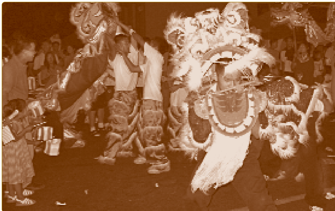
Members of the parish Eucharistic Youth Society dance the dragon, leading the lantern procession for Vietnamese Mid-Autumn Festival at St. Patrick's Catholic Church, San José.

Whose community is being built in this picture? This dragon comes from Vietnam. And yet, like much of the amateur arts being created in immigrant and refugee communities in Silicon Valley, this festival welcomes all viewers to celebrate and to participate. Through sharing their particular tradition, these dancers contribute to the larger process of building the civic community in Silicon Valley.