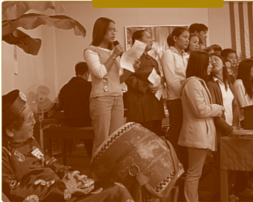
Elders at John XXIII Senior Center, San José, welcome high school students to their celebration of Vietnamese New Year.

For people who filled respected adult roles in their countries of origin, finding themselves reduced to a beginning level English as a second language is infantilizing. Non-verbal communication through the arts gives them a direct way to reclaim and assert their adult status.