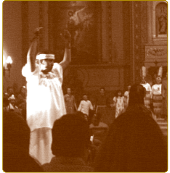
Performance at Mission Church at Santa Clara University.