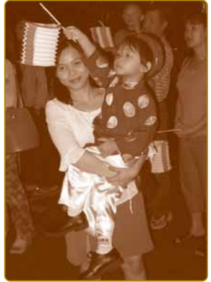
Mother and son join the lantern procession for Vietnamese Mid-Autumn Festival.

Newcomer parents know that if their children are to prosper in Silicon Valley, they will have to embody their bonded cultural traditions, and in addition, know how to bridge beyond them. The participatory arts projects that immigrant adults organize take enormous amounts of work to produce and sustain. The fruition of these projects represents a substantial commitment of volunteer time by immigrants who may well be working multiple jobs to survive in Silicon Valley.