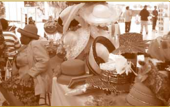
Vendor of original ladies' hats takes a break at the 3 rd Annual Celebration of the Traditions and Principles of Kwaanza, Triton Museum, Santa Clara.