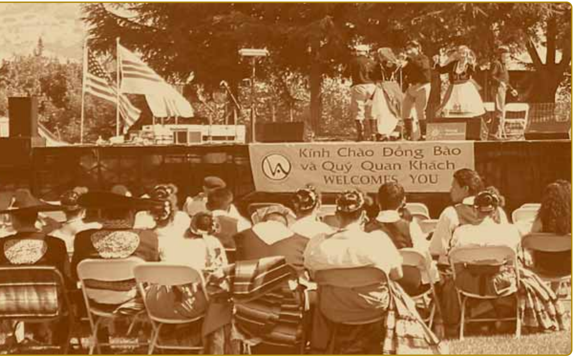
Students from the Xochitl Folklorico dance class at Lincoln High School watch dancers from the Hellenic Traditional Arts and Letters Institute perform at the Mid-Autumn Festival at Evergreen Community College.