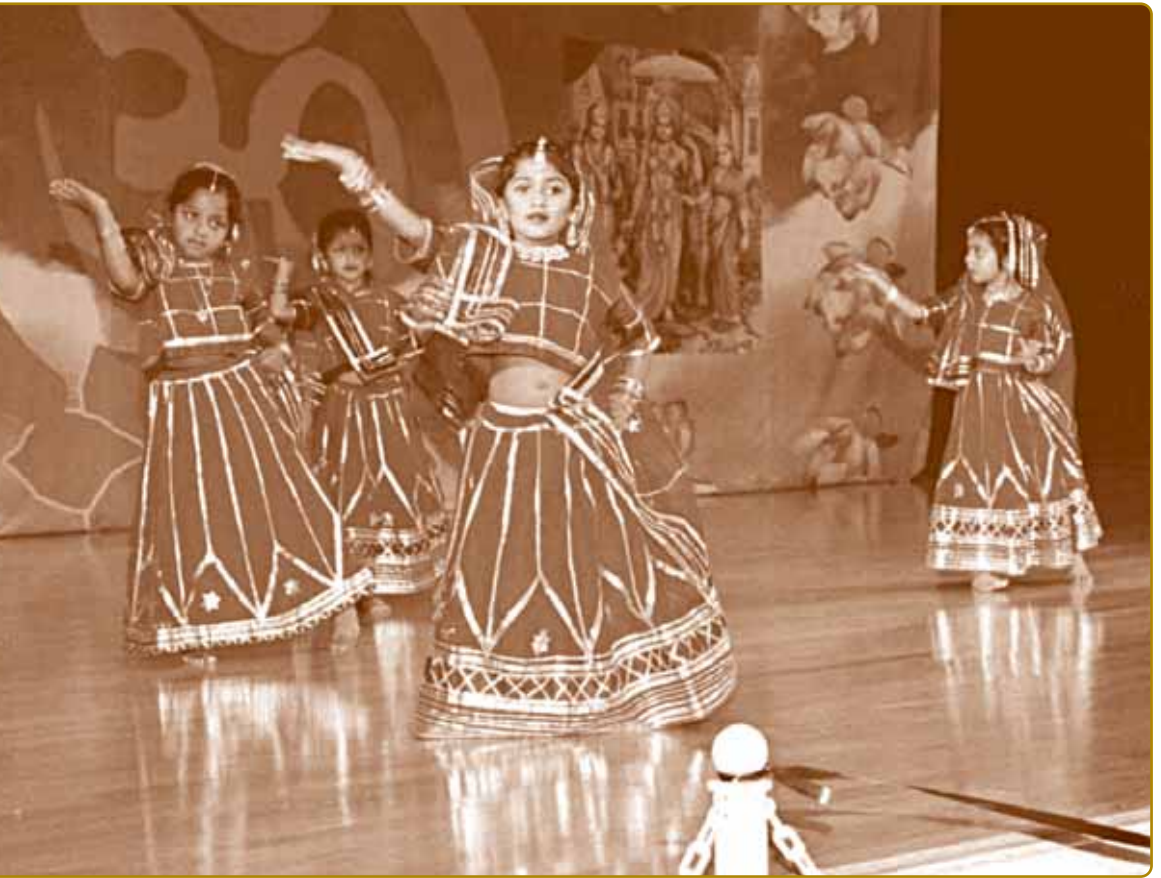
Girls perform classical Indian dances for packed crowds at the Hindu Temple and Community Center, South Bay, in Sunnyvale.