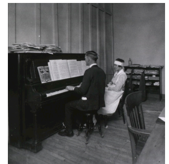
Image: U.S. Army, Fitzsimons General Hospital, Denver, CO Music Room, Educational Department. http://ihm.nlm.nih.gov/images/A0079Z