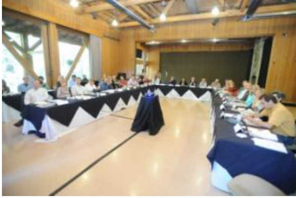
Day 1 at the 2008 National Arts Policy Roundtable