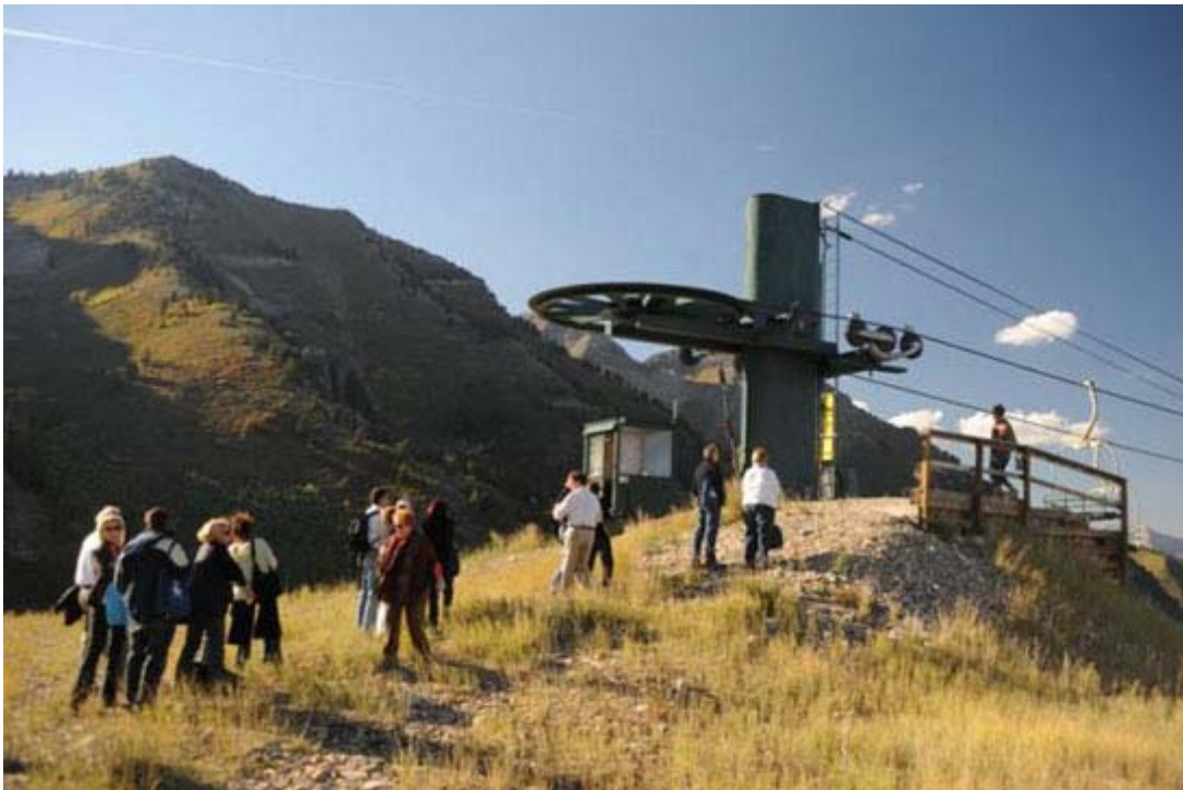
Participants were taken to the Bear Claw ski cabin at the top of the mountain by ski lift for inspiration and discussion.

Arts- or humanities-based civic dialogue/engagement In arts- or humanities-based civic dialogue/engagement, the artistic process and/or art /humanities presentation provides a key focus, catalyst, forum or form for public dialogue/engagement on the issue. Opportunities for dialogue/engagement are embedded in or connected to the arts or humanities experience. In addition, the arts may provide a direct forum to engage in community planning, organizing, activism, and therefore is a form of arts-based civic engagement. (Animating Democracy, Americans for the Arts)