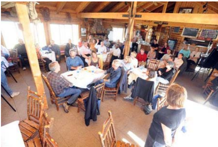
Roundtable participants discuss specific issues in focus groups at the Bear Claw

For instance, Philadelphia's Mural Arts Program, a public and private venture with sponsorship from the City, has created more than 2,700 murals. Social capital is developed each time a mural is commissioned as neighborhoods organize and apply for resources, contribute time and energy, offer ideas for themes and images, and participate with artists and each other in artmaking. Such civic engagement forges social contracts between people and across various block associations, civic groups, congregations, political, and business leaders. 13