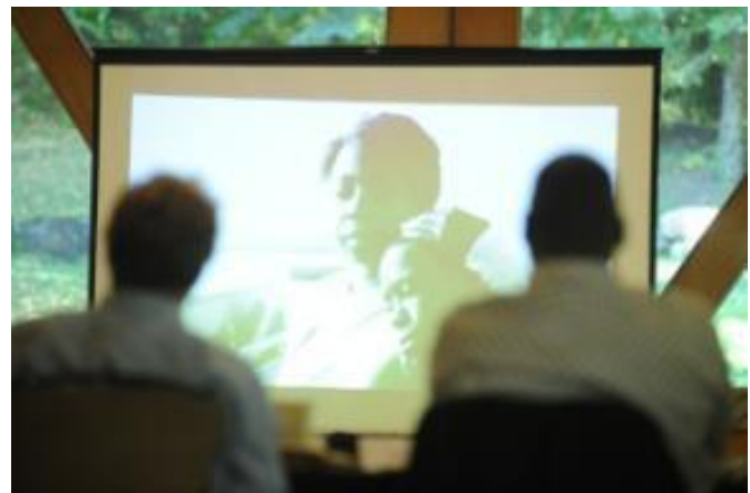
Participants watch a video presentation of Crossroads: Charlotte .

In 2000, Charlotte, NC placed 39th in the category of interracial trust out of 40 communities surveyed by sociologist Robert Putnam. This statistic propelled Crossroads Charlotte , an arts-based planning process in which four plausible stories based on real data about this community's future were creatively translated by artists and then creatively used in community forums to help people imagine fresh responses to the question: "What course will Charlotte chart over the next 10 years as we deal with issues of access, equity, inclusion, and trust in the social, political, economic, and cultural life of the community?" 16 Since 2005, over 3,000 individuals affiliated with corporate, nonprofit, and government organizations have participated in dialogues and the initiative is expanding now to the broader public. At the same time, the Foundation for the Carolinas has also reoriented to strategically address civic issues through a new Center for Civic Leadership.