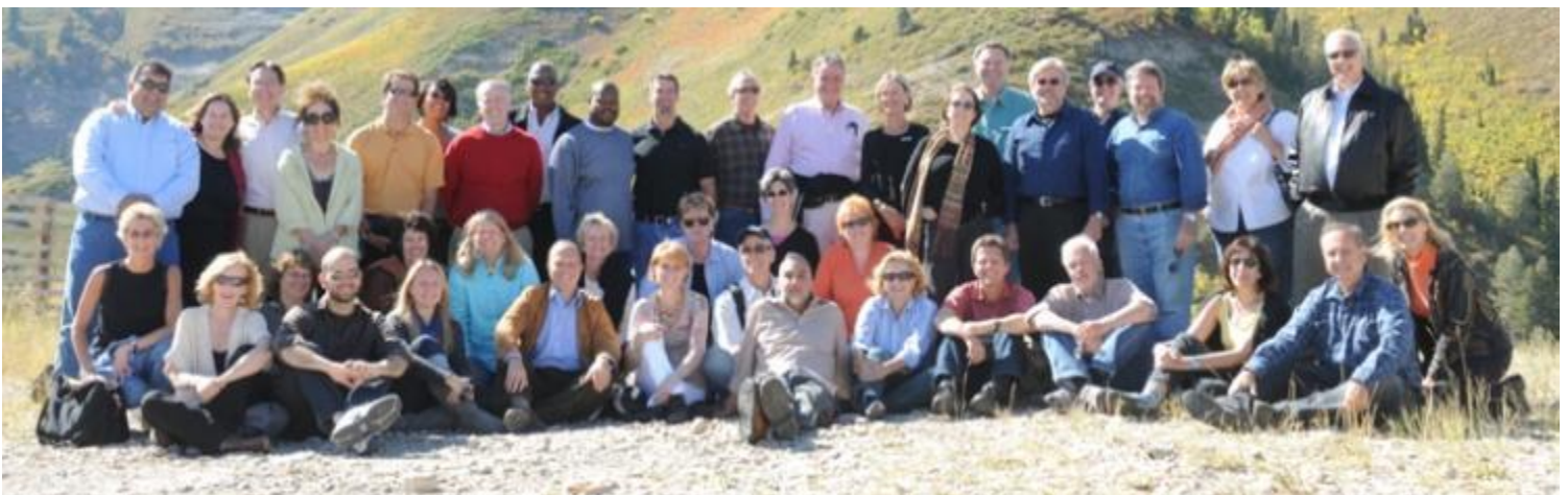
Members, presenters, and staff of the 2008 Americans for the Arts National Arts Policy Roundtable.

Advance strategic alliances across sectors that promote and establish common cause between the arts and proponents of civic dialogue, deliberation, and engagement.