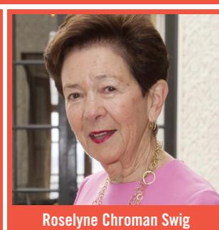
Philanthropy in the Arts Award